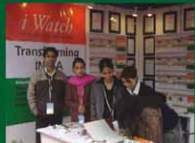
Pravasi Bhartiya Divas, New Delhi, India

i Watch 211, Olympus Altamount Road Mumbai-400 026