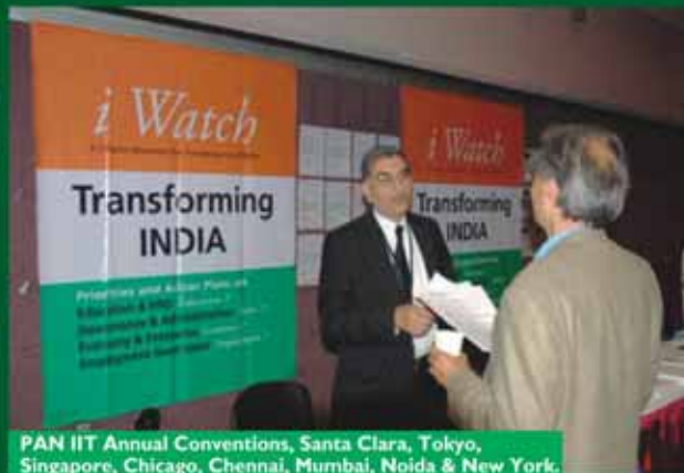
PAN IIT Annual Conventions, Santa Clara, Tokyo, Singapore, Chicago, Chennai, Mumbai, Noida & New York.