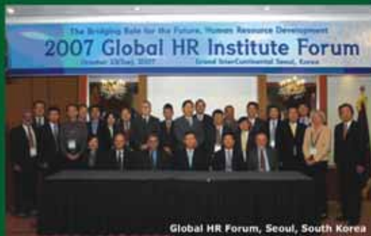
Global HR Forum, Seoul, South Korea